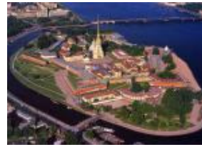
Peter and Paul Fortress