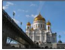
Christ the Saviour